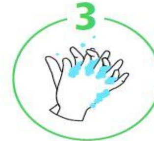
In between the fingers